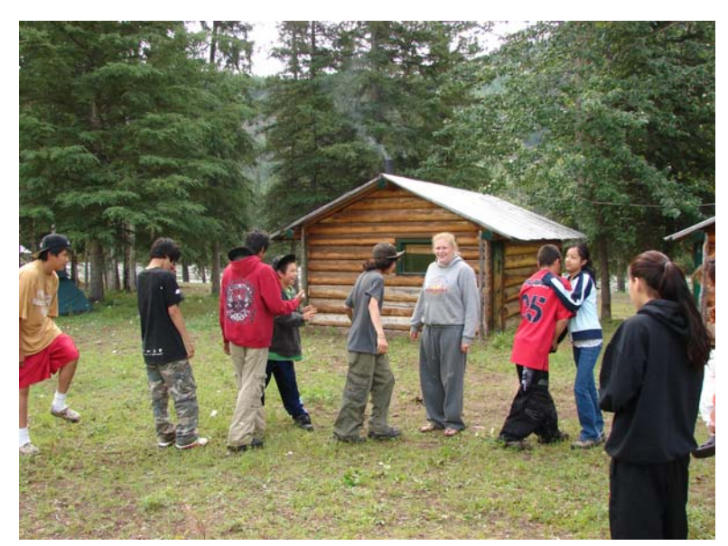
The morning hug was a good way to get to know each other and become more comfortable with everyone in the group.