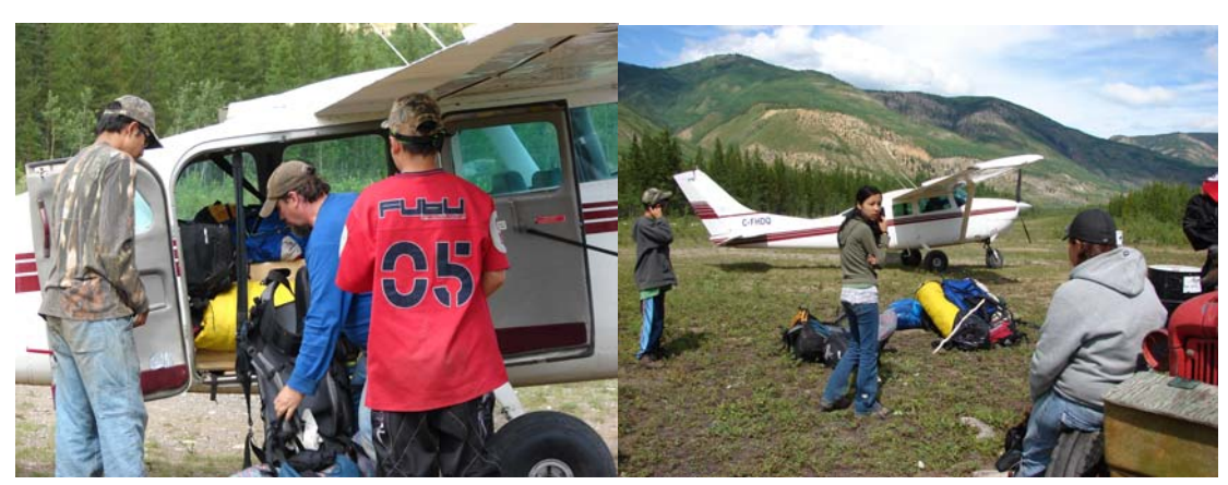
Leaving Camp by plane.