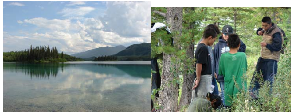
Left: 1<sup>st</sup> lake on the hike; Right: Stopping for a break.

o Horseback Riding- All of the youth was excited about riding the horses and they all got a chance to do so. With the help of some of the camp wranglers the horses were saddled and the youth and councilors took it in turns to ride.