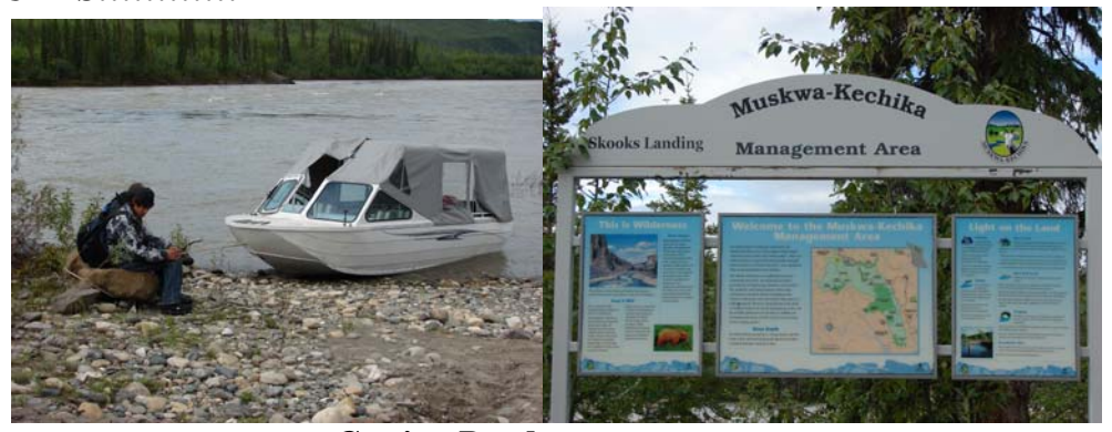
Getting Ready to go to camp.