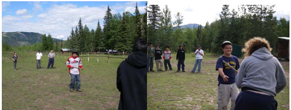
The object of this game is to grab the stick from the other team while they try and make you smile, this can be quite hard because the other team can do anything to make you smile.

In this game the person with the blindfold has to learn to use their sense of hearing to detect when someone is near before the thieves get their stick.