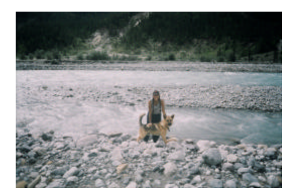
The Knight brothers guided the participants about five miles up the valley, teaching them about the natural

Wokpash River is located 50 km south of Toad River, in the heart of the northern Rockies. It is a world famous hike, made up of stunning landscapes and pristine wilderness.