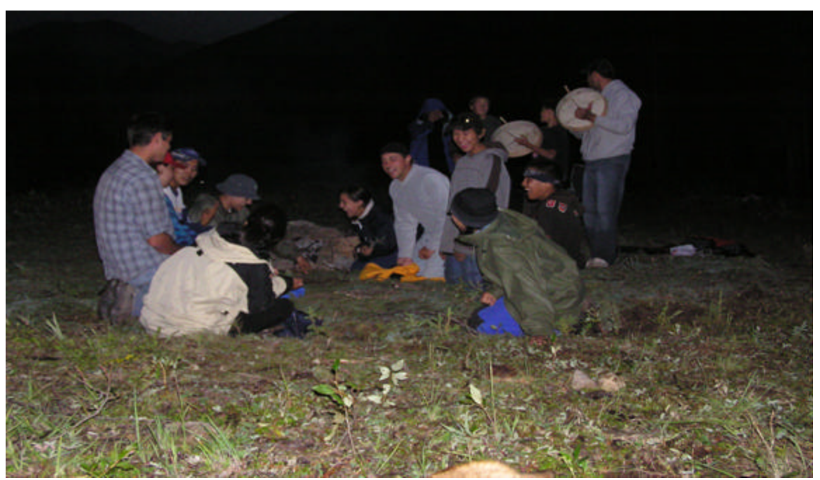
Friendly game of Stickgambling.