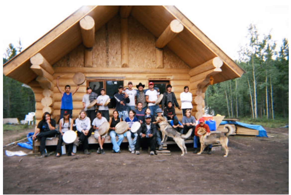
2004 MK Environmental Youth Camp Participants.