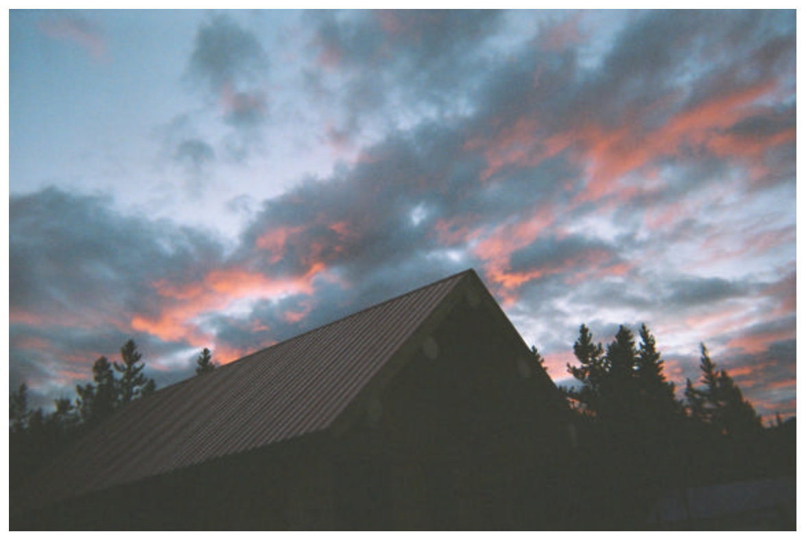
Beautiful sunrise over the cook shack.