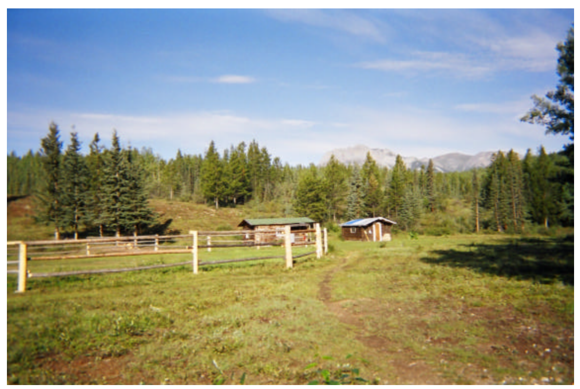
Angus McDonald's yard at Moose Lake, BC.