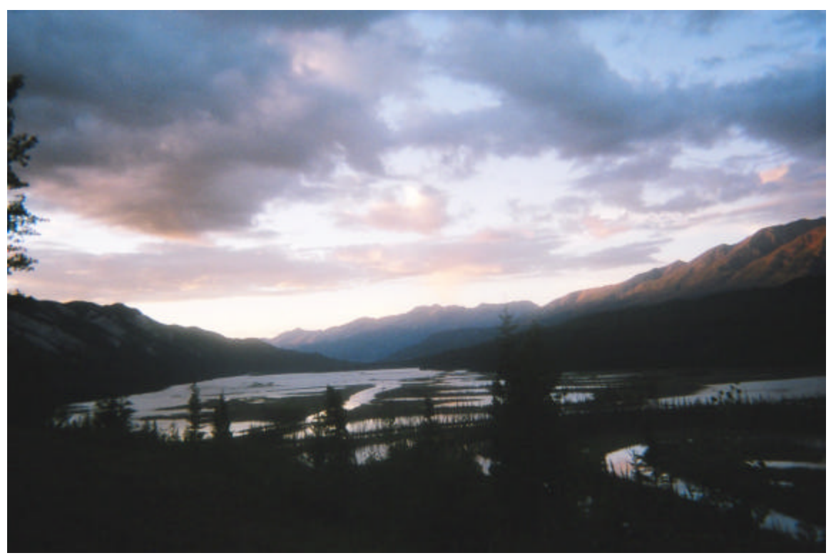
Looking up the valley at Moose Lake.