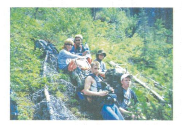
youth that represented Kaska, Sekannie, Tahltan, Cree, Tlingit and Slavey cultures.

Youth of various ethnic backgrounds, such as Ukranian, Danish, Irish, German, Norwegian, and Japanese, joined together with First Nation