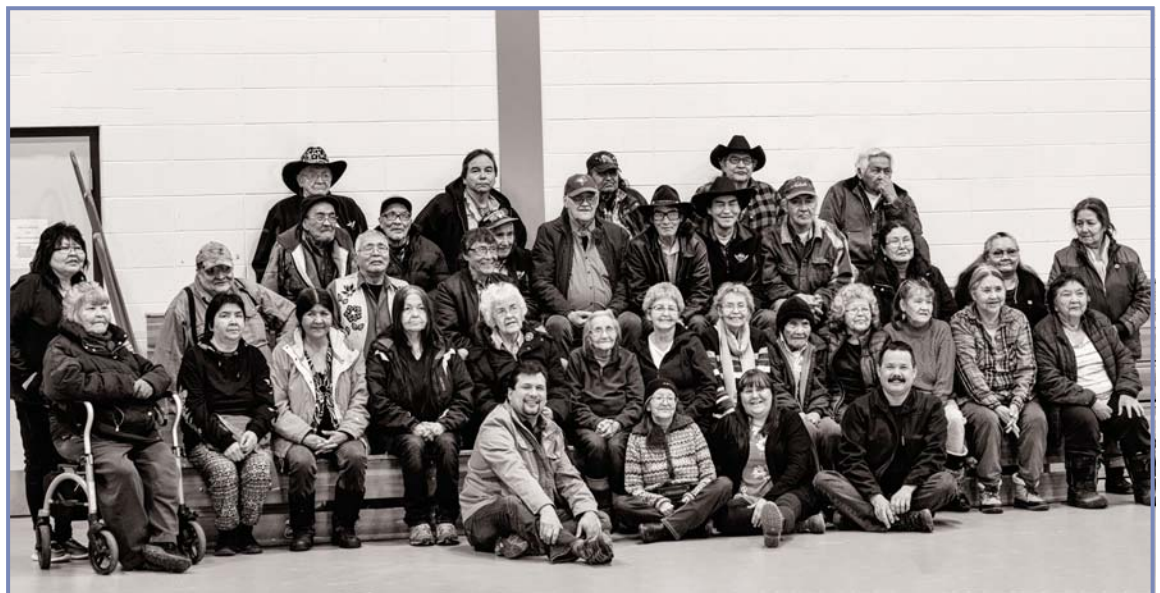
Elder's Gathering, Watson Lake, 2019

An Elder's gathering was being planned for September 2020. The gathering that we held in Watson Lake in 2019 was a great success and Elders requested that we do this on a regular basis. In response to that request plans were in motion, but regrettably had to be put on hold due to COVID-19. Be assured plans will resume for an Elders Gathering once it is safe to do so.