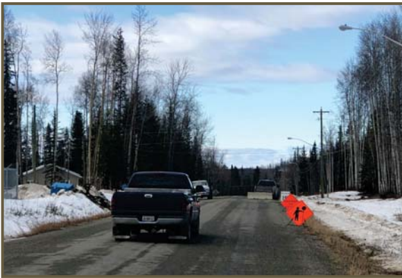
Security Check Point Lower Post