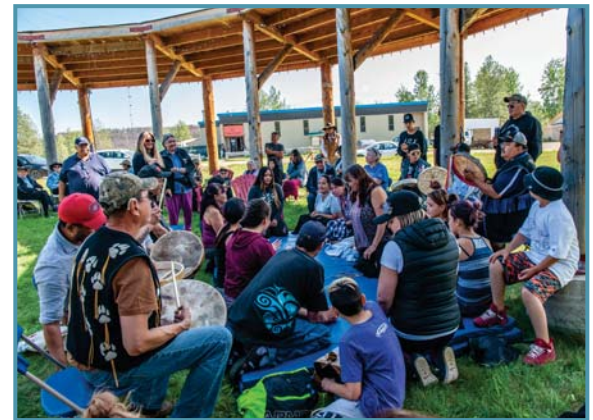
Enjoying the KDC GA in Lower Post, July 2019

The KDC Annual General Assembly is a gathering we all look forward to. It is a time for KDC to report out on all the initiatives of the year, unite with family and friends and celebrate our Kaska heritage. There is also a legal requirement under the BC Society's Act for Societies such as KDC to hold an Annual General Assembly. However, this year due to COVID-19 a revision to that legal requirement was implemented by the BC Society's Act allowing for the deferment of a Society's AGA for 2020. This is consistent with KDC's