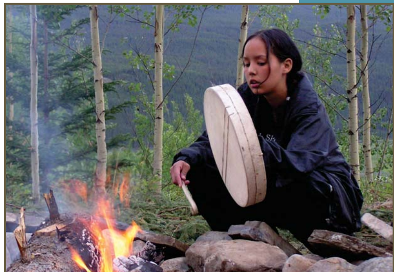
Kaska youth warming drum over fire at MK Kaska Youth Camp, July 2004