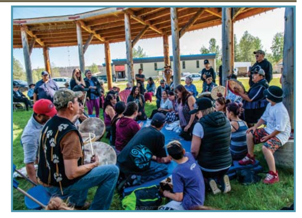
Enjoying the KDC GA in Lower Post, July 2019

The KDC Annual General Assembly is a gathering we all look forward to. It is a time for KDC to report out on all the initiatives of the year, unite with family and friends and celebrate our Kaska heritage. There is also a legal requirement under the BC Society's Act for Societies such as KDC to hold an Annual General Assembly. However, this year due to COVID-19 a revision to that legal requirement was implemented by the BC Society's Act allowing for the deferment of a Society's AGA for 2020. This is consistent with KDC's