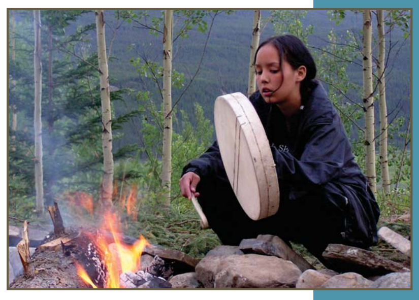
Kaska youth warming drum over fire at MK Kaska Youth Camp, July 2004

In January 2020. KDC brought a contingent of youth to Prince George to attend a four-day workshop and experience the work their leaders do. The youth stressed the importance of bringing together the youth of all the Kaska Nations and spending time on the land with Elders.