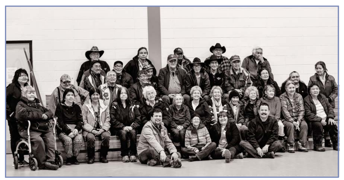
Elder's Gathering, Watson Lake, 2019

An Elder's gathering was being planned for September 2020. The gathering that we held in Watson Lake in 2019 was a great success and Elders requested that we do this on a regular basis. In response to that request plans were in motion, but regretfully had to be put on hold due to COVID-19. Be assured plans will resume for an Elders Gathering once it is safe to do so.