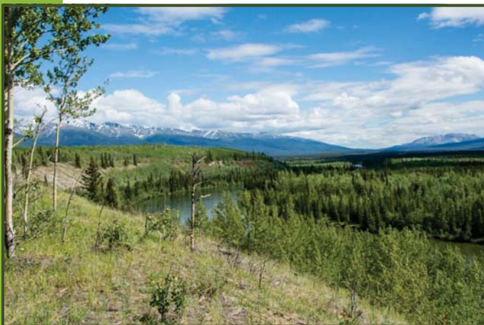
Ne'ah (Horseranch Range)

The Strategic Engagement Agreement calls for the development of a Management Plan for the proposed Ne'ah Conservancy and Boya Lake Provincial Park. It also calls for a Kaska name for Boya Lake Provincial Park. The proposed Kaska name is: (Tachilla) Tuch'ita [a.k.a. Boya Lake] Park . The Management Plan will address other management considerations. The next steps include confirming the Kaska name for Boya Lake, gathering more information on Kaska Dena cultural values and setting up a meeting for review of the completed draft Management Plan.