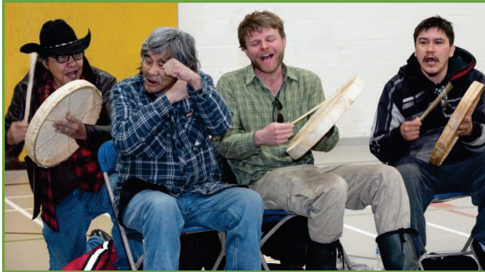
Kaska Drummers - Ross River

there was a unanimous voice from the Elders saying, "it's been great reconnecting with old friends, family, sharing stories, laughing, dancing this must happen again!"