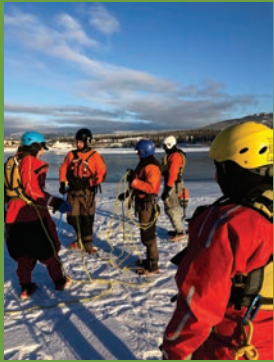
Ice Rescue River Training

Objectives of our program include building/increasing capacity in wildlife management, species at risk management, habitat management, water management and land use management. Monitoring and maintaining culturally and socially acceptable land use for economic purposes; maintaining and monitoring Kaska culturally important wildlife, wildlife habitats, and ecosystems over time; and maintaining and monitoring Kaska culturally important large rivers, wetlands, and lakes and the respective water quality over time.