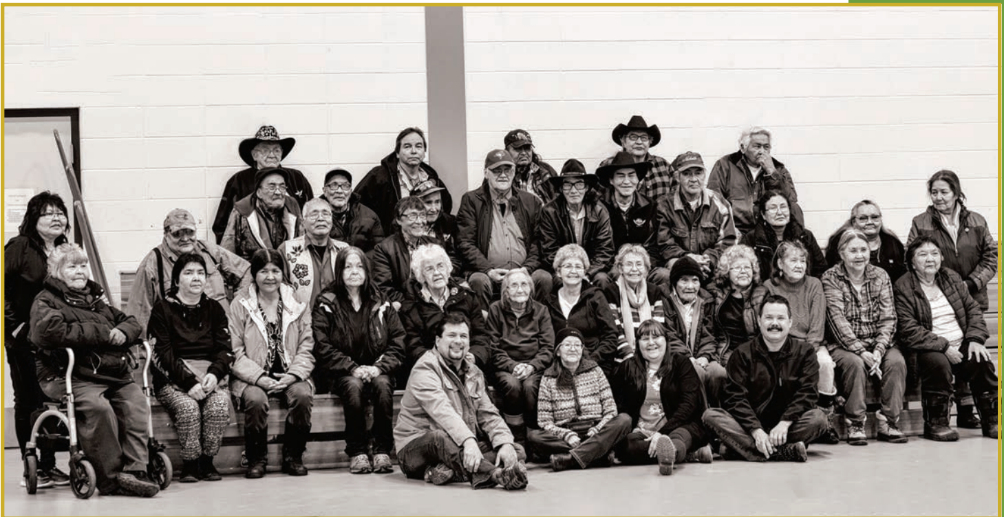
Elder's Gathering, Watson Lake, 2019