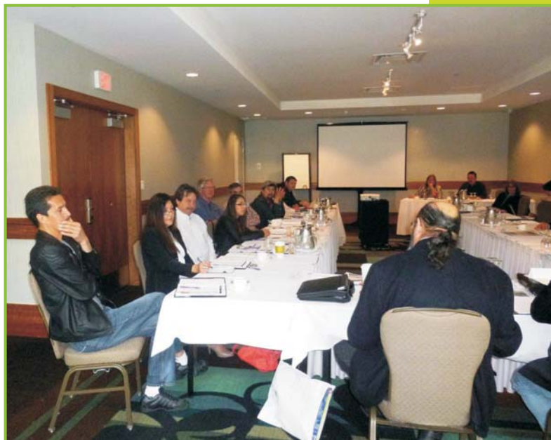
Kaska Dena Strategy Session

Day 1 of the Strategy Session focused on hearing about the experiences of other First Nations who have negotiated a Treaty under the BC Treaty Process.