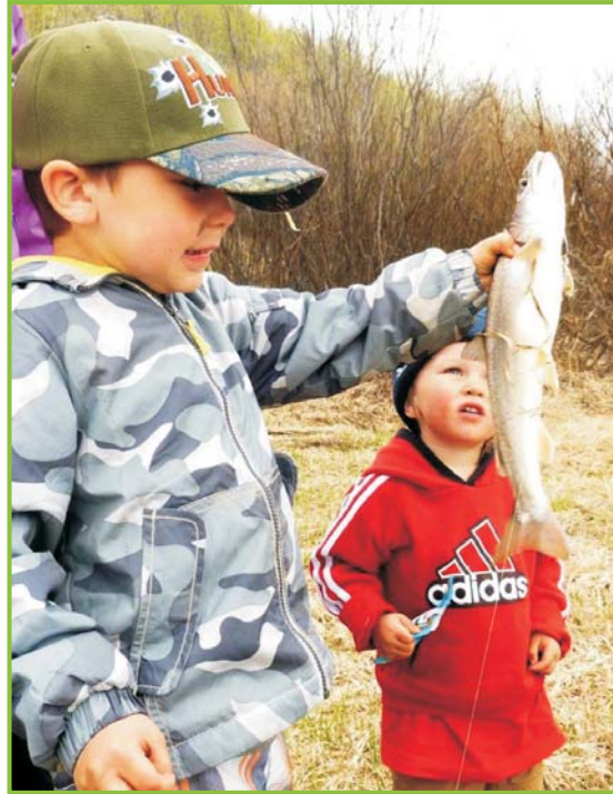
Dease River First Nation youth

Establishment of Committees where appropriate (ie: Governance Committees)