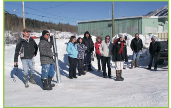
Waiting to board the helicopter in Good Hope Lake

Our Elders have spoken the oral history of the area being a place to go when times were lean because it was a place food could be reliably found. It was a resting stop for Kaska using the Davie and McDames trail system, and it was an area where Kaska families lived year round. The area is important as it is a place where many of our culturally important wildlife thrive, it has many culturally important sites, is core component of our trail system with the mountain range having a concentration of trails related to our seasonal