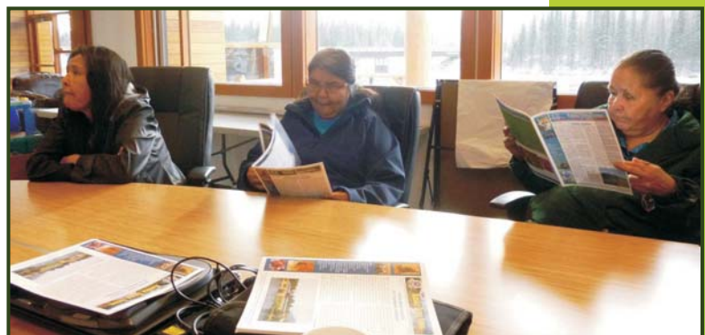
Kwadacha First Nation elders

The community representatives will be hired in each community by July 14th. A part of their role will be to provide the connection between the community and the Kaska Dena Council negotiating Team.