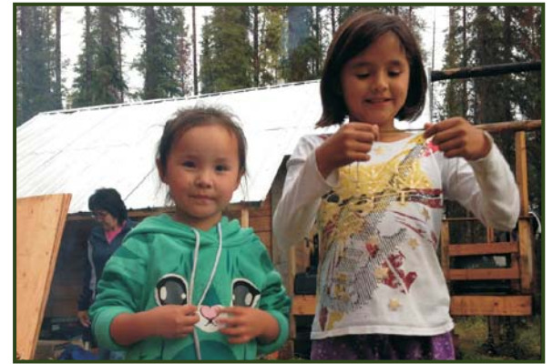
Kwadacha First Nation youth