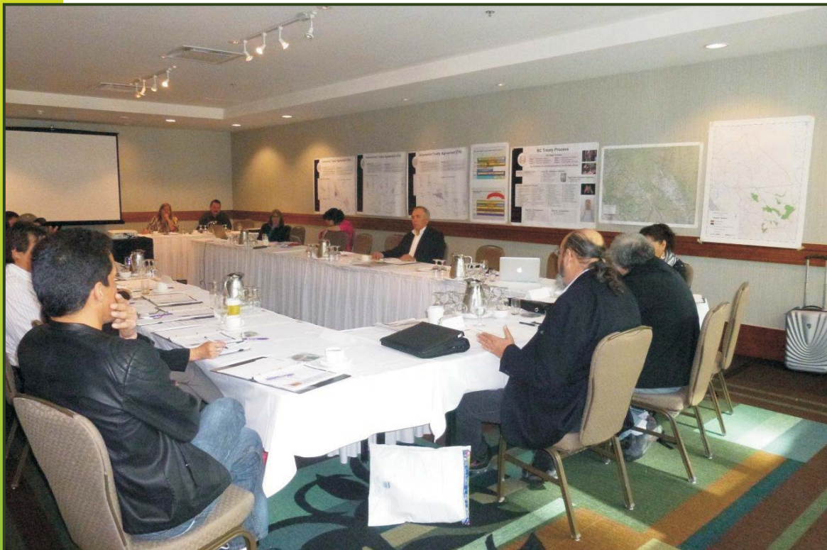
Kaska Dena Strategy Session

Day 2 of the Strategy Session focused on the Kaska Dena leadership learning about the current status of the Agreement in Principle Negotiations, receiving clarification on outstanding issues and giving direction to KDC negotiators on how to proceed in to complete the AIP.