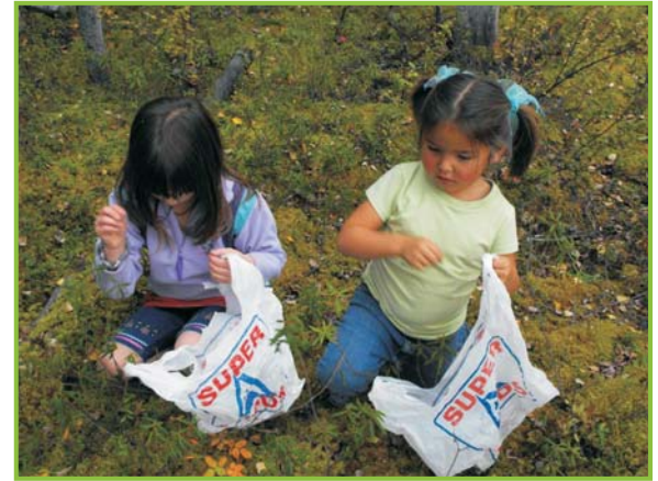
Daylu Dena Council youth