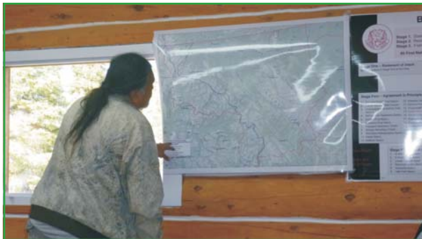
Good Hope Lake