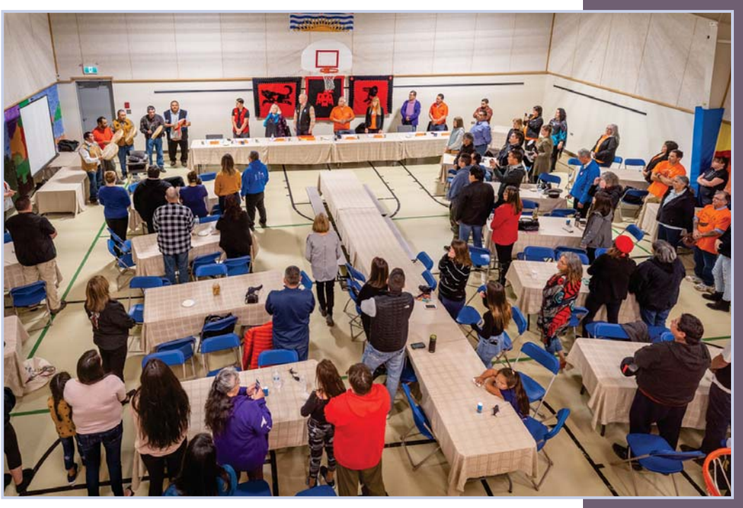
Community Feast at Denetia School.

In a press release following his visit, the Premier confirmed his commitment to seeing the residential school removed and replaced. The Premier said. "For generations, the former residential school has brought so much pain to the community in Lower post. It is unacceptable that this building remains today as the community's administration building..."