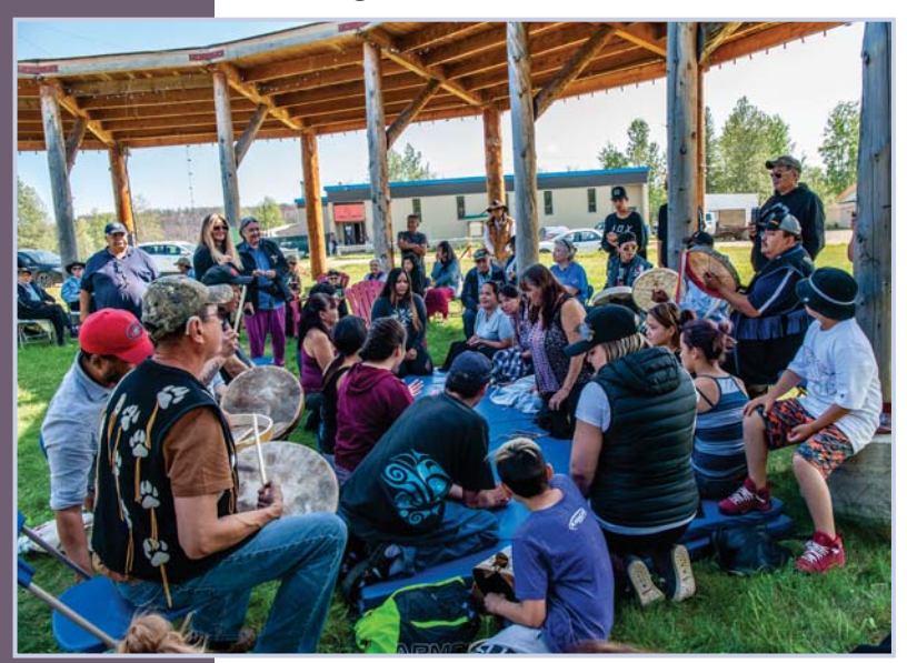
Traditional Hand Games.

The General Assembly was well attended and as always, Kaska enjoyed being together, learning about the work that has been