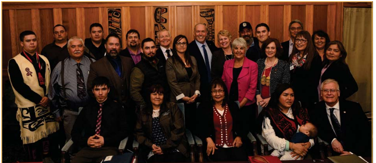
3 Nations delegates met with Premier Horgan and Cabinet Ministers in February, 2018.

3 Nations are looking forward to pursuing new possibilities and will continue to work together to make the necessary changes to ensure that we play a vital role in improving wildlife management, education, and social well-being across our territories.