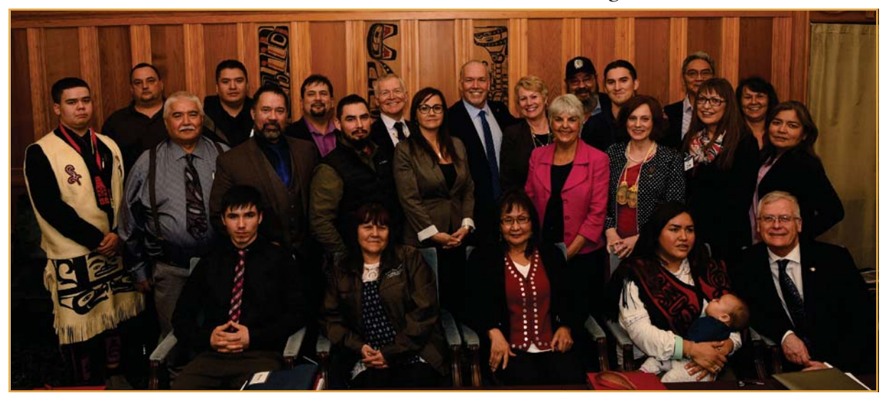
3 Nations delegates met with Premier Horgan and Cabinet Ministers in February, 2018.

3 Nations are looking forward to pursuing new possibilities and will continue to work together to make the necessary changes to ensure that we play a vital role in improving wildlife management, education, and social well-being across our territories.